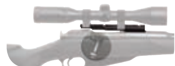
Mosin Nagant Scope Mount #MOI0600 $47.75 MSRP