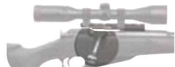
Mosin Nagant Bolt Handle #MOI0700 $22.99 MSRP